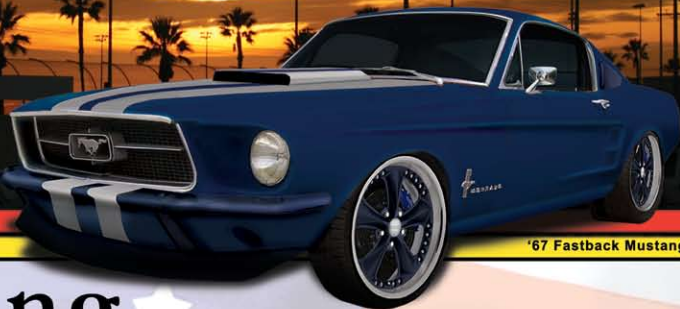
'67 Fastback Mustang