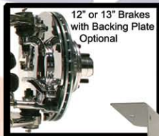
12" or 13" Brakes with Backing Plate Optional

FREE FREIGHT call your local dealer about special package promotions