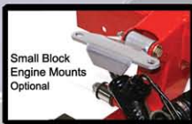
Small Block Engine Mounts Optional