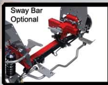
Sway Bar Optional