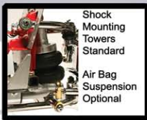
Shock Mounting Towers Standard Air Bag Suspension Optional