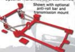
Shown with optional anti-roll bar and transmission mount