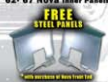
with hardware of Nova Front End

Please Mention this Ad for your Special Package Deals