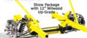
Show Package with 12" Wilwood Up-Grade