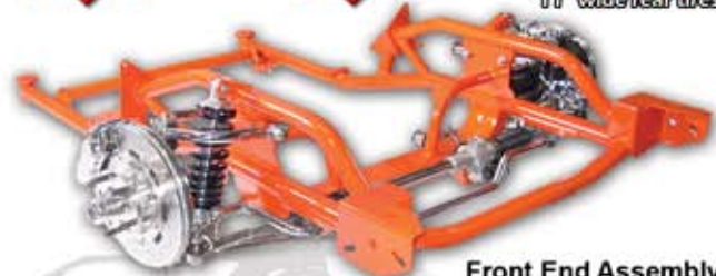
Front End Assembly

'67-'69 Camaro Fits up to 10" wide front tires 11" wide rear tires