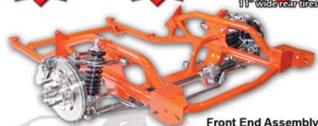
Front End Assembly

'67-'69 Camaro Fits up to 10" wide front tires 11" wide rear tires