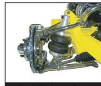
Front Shockwave Option