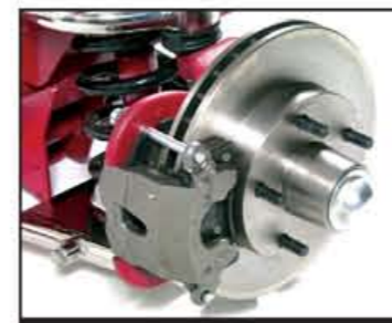
GM Brake (Plain & Chrome Pkg)