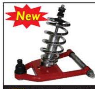
NEW Coil-Over Retro Fit Kit