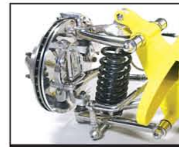
Custom Brake (Stainless Pkg)