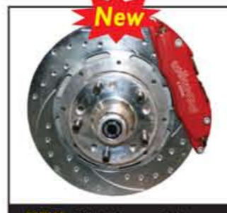
NEW 12" 6-Piston Calipers