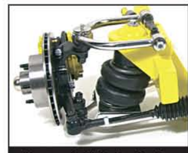
Mustang II Air Spring Option