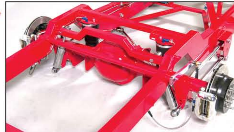
Stepped Rail Option