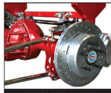
12" Disc w/ Internal Parking Brake