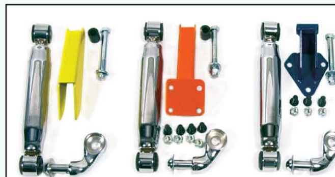
Dropped Axle — Front Shock Kits

Tie-Rods and Drag-Links come with tie-rod ends, jam nuts and bar. Tubes available in plain, chrome, or stainless. Chrome ends and jam nuts supplied with chrome and stainless tubes. Specify application or center to center length when ordering. Plain and chrome tie-rod ends with jam nut available separately.