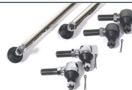
Tie Rods, Drag Links & Ends

Perchs available in plain, chrome, or polished stainless.