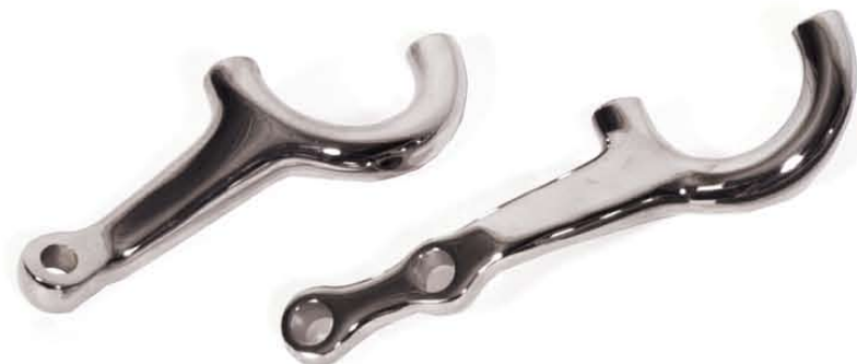
Lower Steering Arms

Includes: mount, chrome bolt and stainless washer. Available in plain, chrome, or polished stainless.