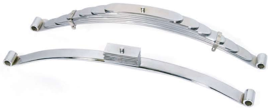
Dropped Axle Front Leaf Springs