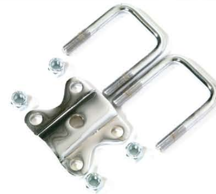
Front U-bolt Kits