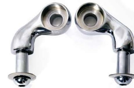
Lower Shock Mounts

Includes 2 U-bolts, 5-hole spring plate, & lock nuts.