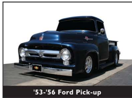
'53-'56 Ford Pick-up