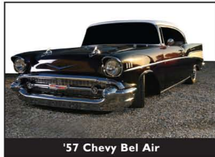
'57 Chevy Bel Air