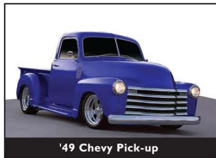
'49 Chevy Pick-up