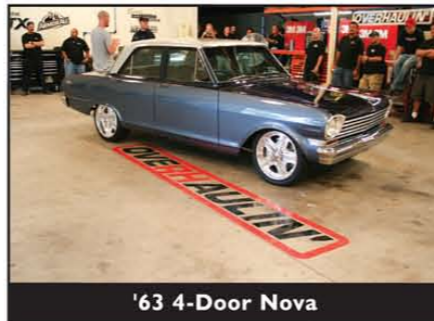
'63 4-Door Nova