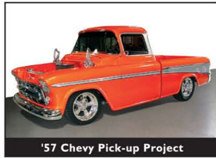
'57 Chevy Pick-up Project