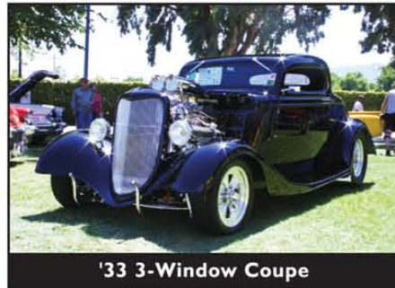
'33 3-Window Coupe